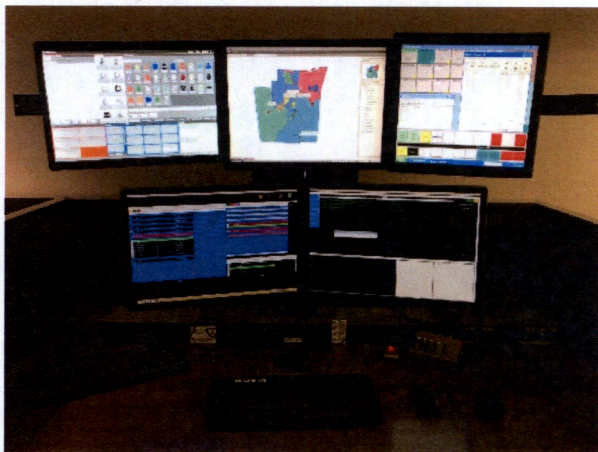
Display of a fully outfitted dispatch console

VESTA phone system (top left in picture)