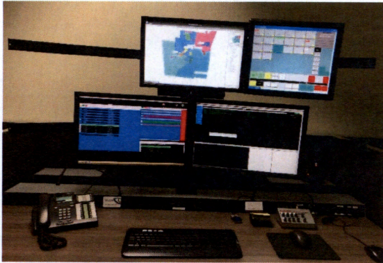
Station six (6), missing the VESTA phone system

Stations six (6) and seven (7) have a Nortel phone system and don't have the same features as the other five stations because they are two different phone systems. This results in inaccurate statistics because they are not fully functional consoles and they need VESTA in order for all seven (7) stations to mirror each other. The VESTA system has a rolodex of numbers entered 1-571 that are one button quick transfers. Our desk phones do not have that capability.