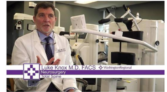
YourHealth Today on KNWA