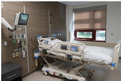
Neurosurgical Intensive Care Unit

To best serve patients who are recovering from stroke, spinal cord injury, brain injury or neurological illness, last year Washington Regional opened the area's first Neurosurgical Intensive Care Unit. With Arkansas Children's Hospital expanding to Northwest Arkansas to provide pediatric care, Washington Regional's former in-patient pediatric unit was repurposed and outfitted as a 20-bed Neurosurgical ICU. In addition to a highly specialized nursing staff, everything in the unit is designed to accommodate the complex intensive care needs of neurological-neurosurgical patients. The Neurosurgical ICU features advanced neurological tools such as continuous electroencephalography as well as dimmable lights, specialized ceiling-mounted lifts for repositioning patients, bedside monitors and a nurse call system that helps to identify patients with certain risk factors.