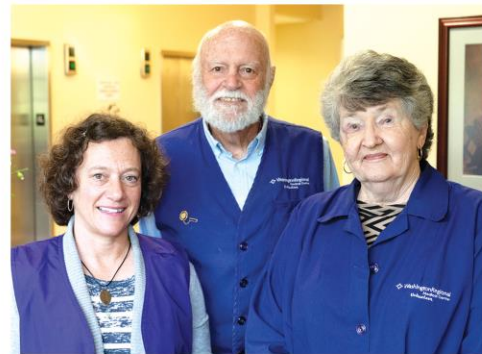
Washington Regional volunteers

Members of the Washington Regional Medical Center Auxiliary serve patients, guests and staff members as volunteers throughout the hospital and as fundraisers throughout the community. Last year they volunteered more than 16,500 hours of service, contributed $131,400 for hospital programs and partnered with United Way of Northwest Arkansas for the organization's "Fill the Bus" school-supply drive.