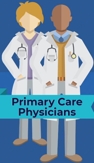
Primary Care Physicians